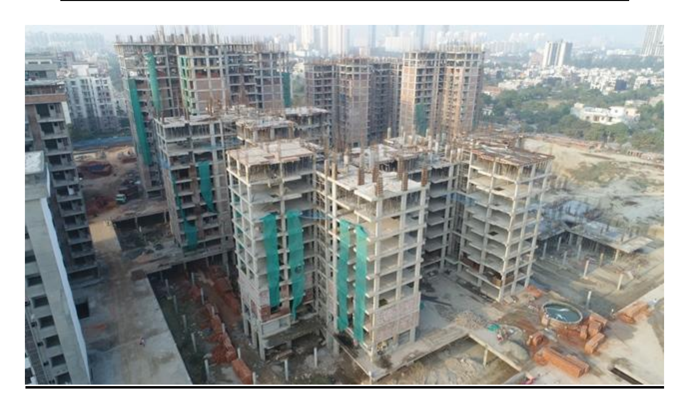
In Block C-08 14<sup>th</sup> floor columns casting in progress.

Block C 01 Level-09 Slab shuttering work in progress.In Block C-02 Level-10 slab shuttering & Reinforcement binding in progress.